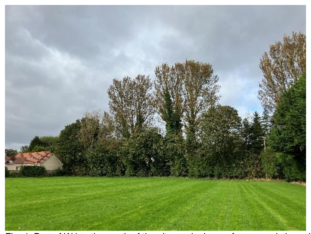
Fig. 4: Part of W4 to the south of the site, and a house from an existing adjacent street