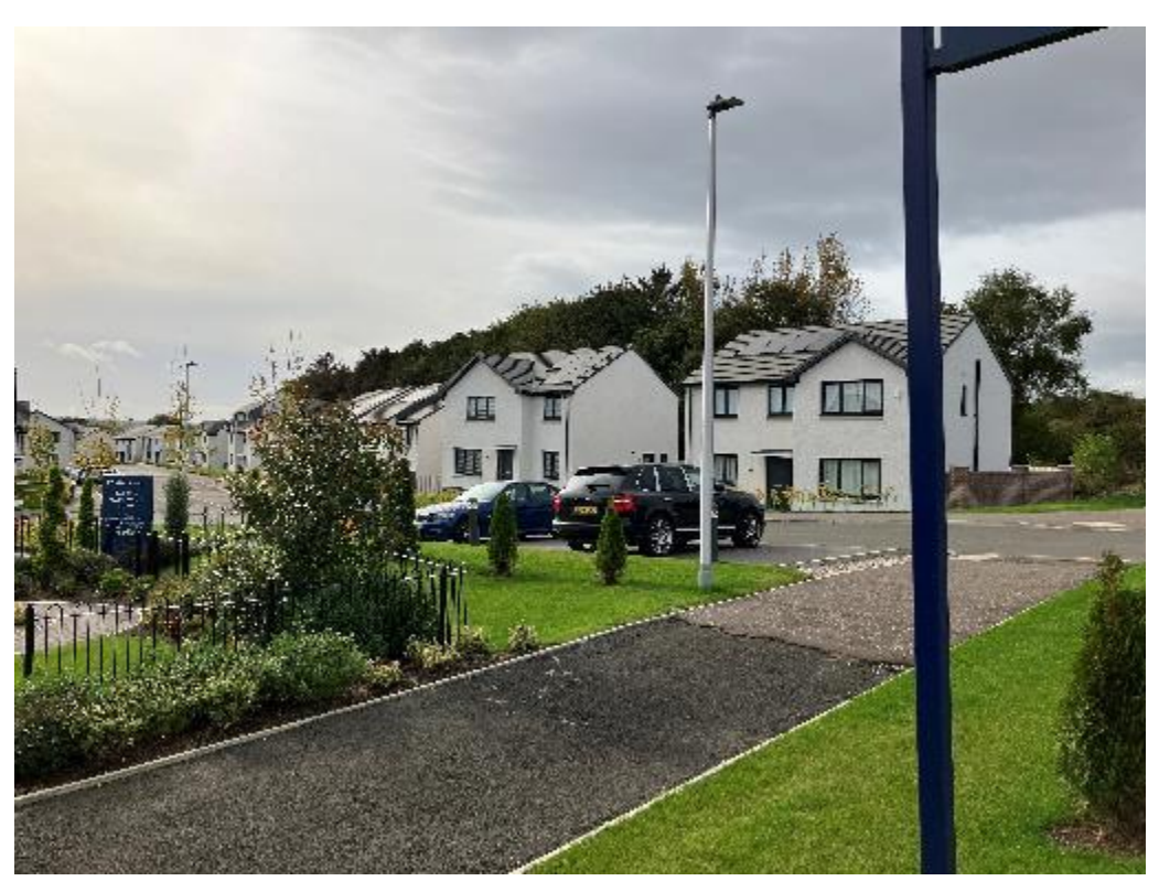
Fig. 2: W1 behind the newly built houses