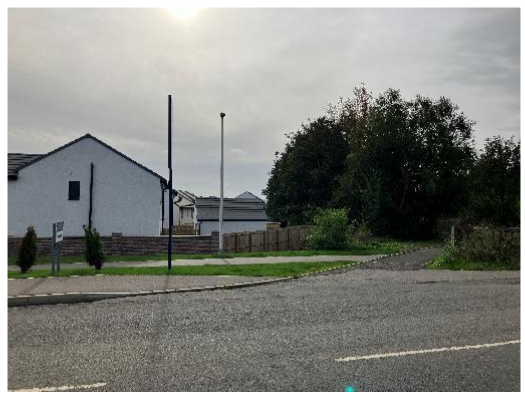
Fig. 1: the north end of W1